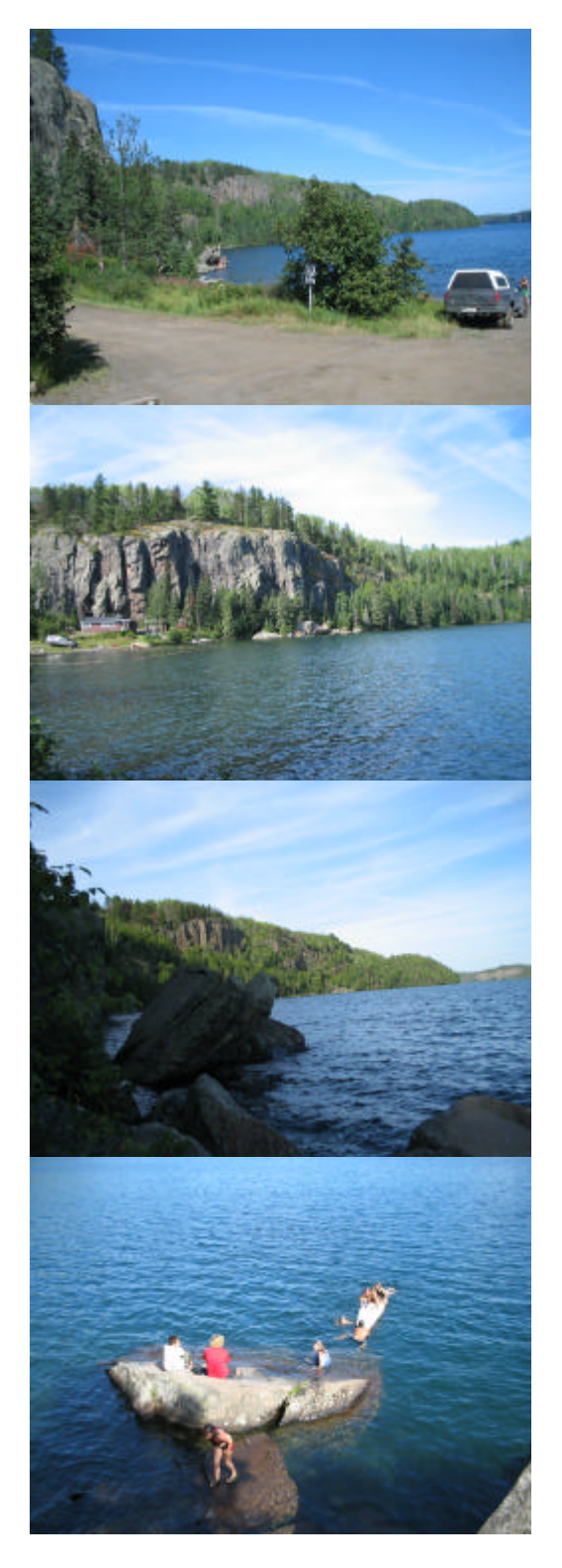
Everyone enjoyed swimming at the "Rocks" in Oliver Lake. With "bathtub" warm water that is deep enough to dive from the high or low points.